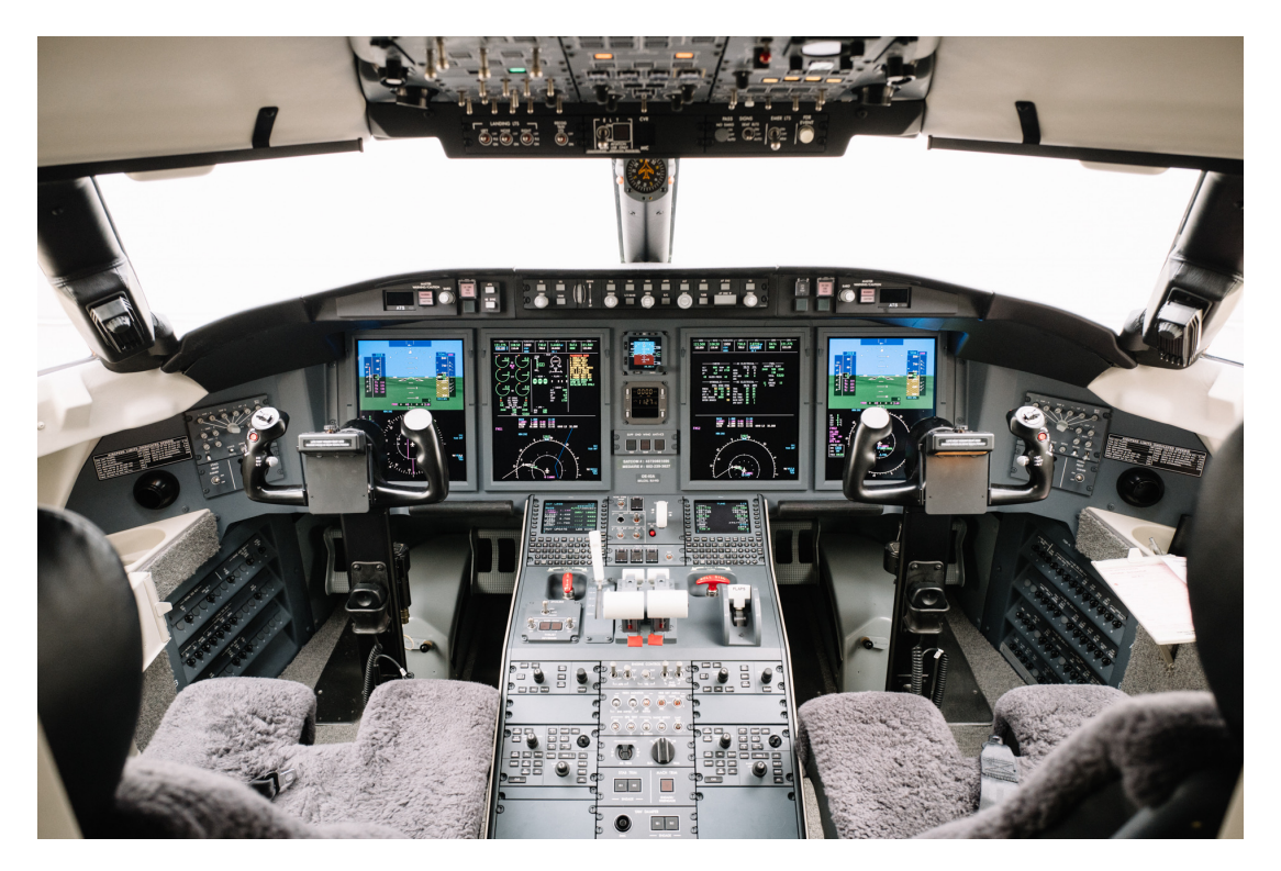
Flight Deck (FILE PHOTO)