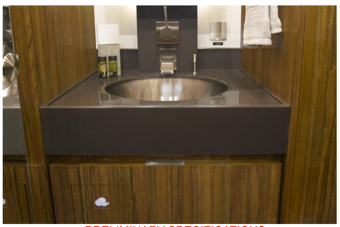
Lavatory Sink PRELIMINARY SPECIFICATIONS