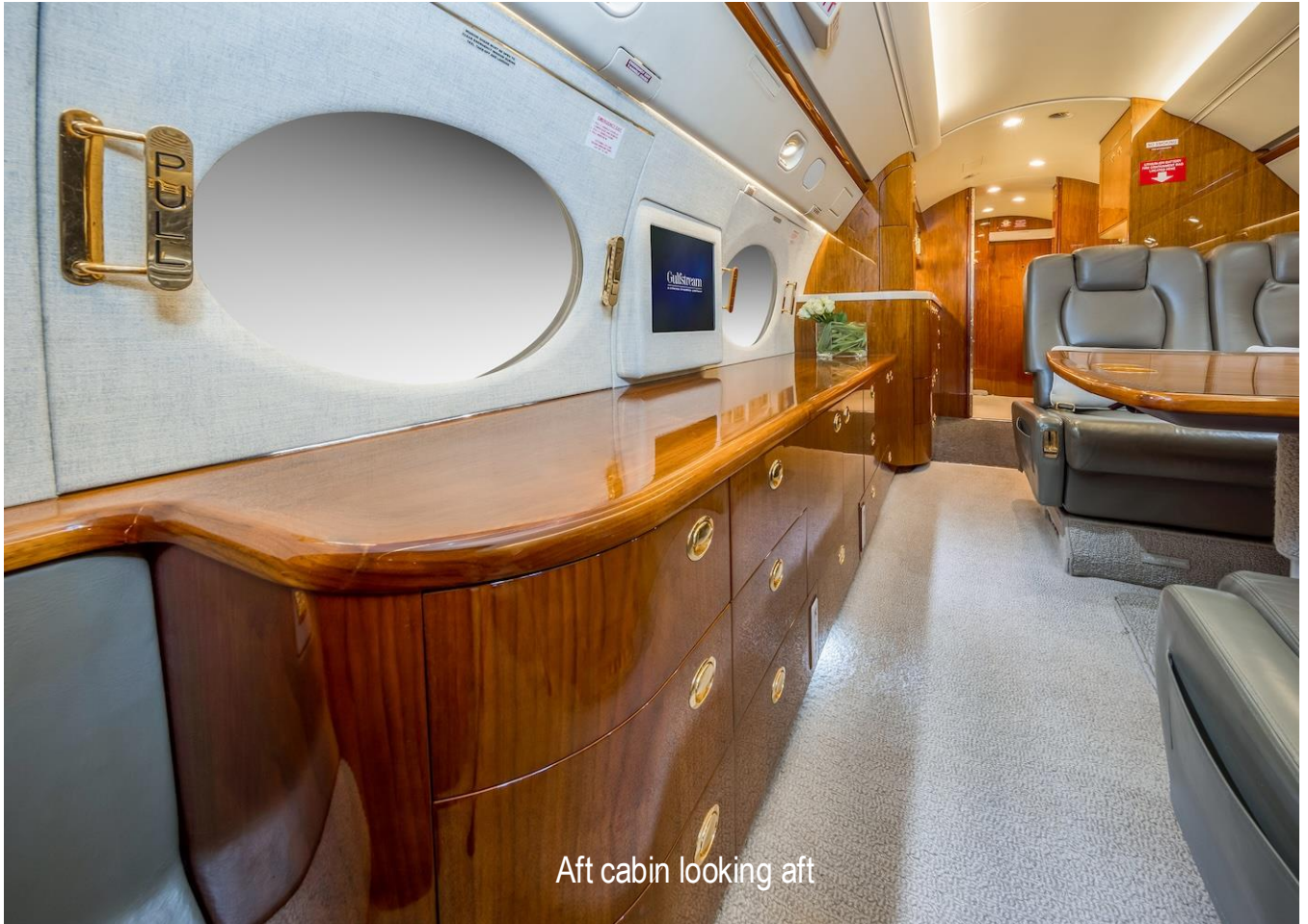
Aft cabin looking aft

Specifications subject to verification upon Buyer's inspection. Aircraft offered subject to prior sale or removal from market.