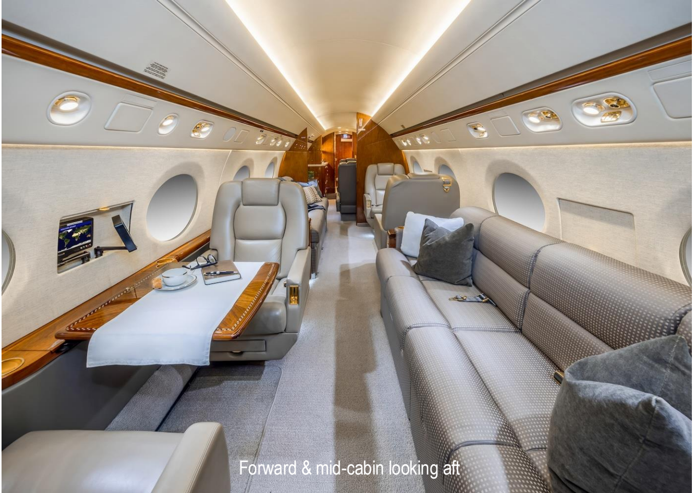
Forward & mid-cabin looking aft

Specifications subject to verification upon Buyer's inspection. Aircraft offered subject to prior sale or removal from market.