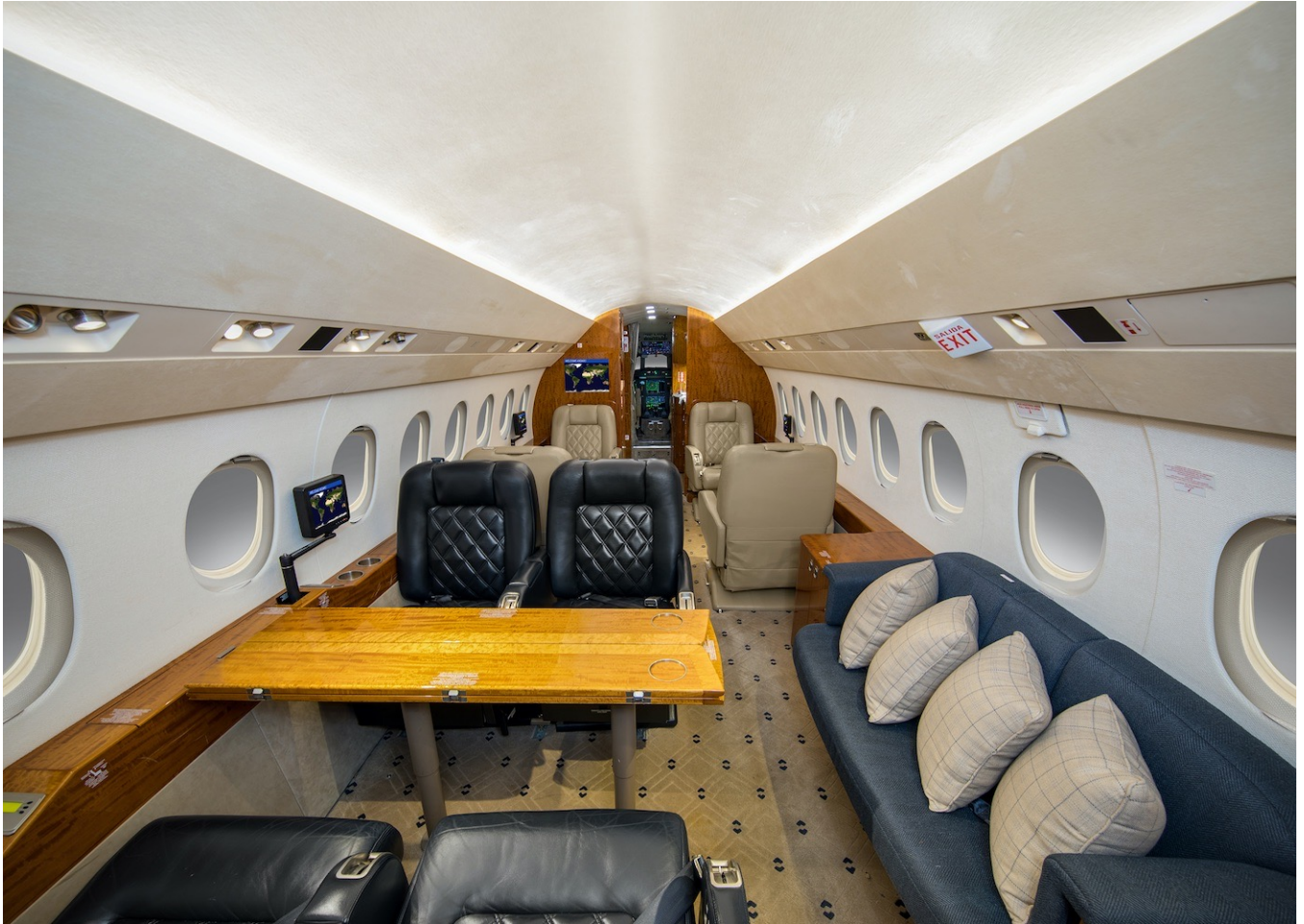
Aft cabin looking foward

Specifications subject to verification upon Buyer's inspection. Aircraft offered subject to prior sale or removal from market.