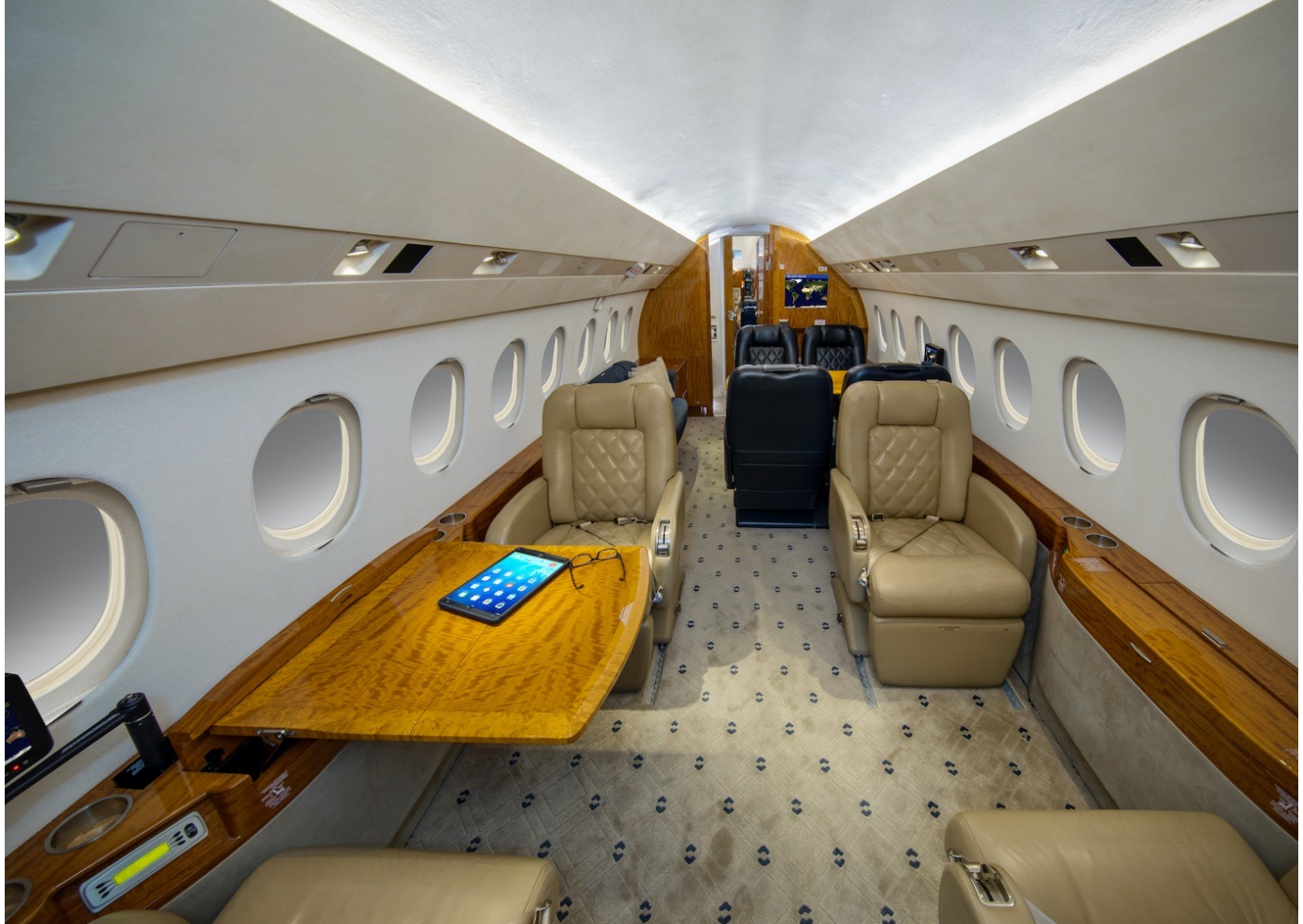
Forward cabin looking aft

Specifications subject to verification upon Buyer's inspection. Aircraft offered subject to prior sale or removal from market.