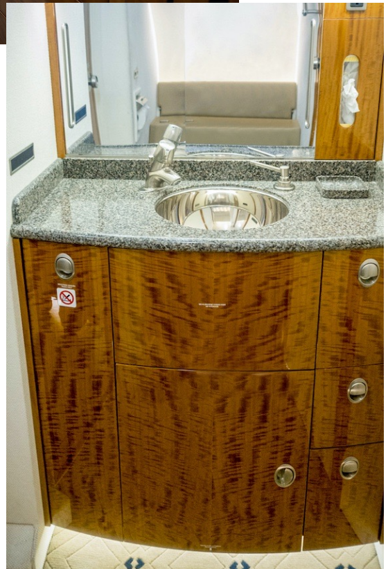
Aft Lavatory Sink

Specifications subject to verification upon Buyer's inspection. Aircraft offered subject to prior sale or removal from market.